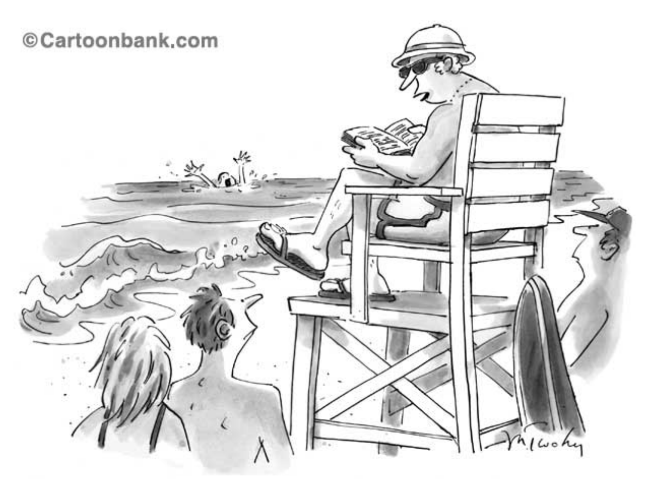
"We're encouraging people to become involved in their own rescue."